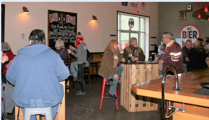
More than 90 people from the eight Kansas City area churches that participated in the mission festival enjoyed the fellowship at the Kansas City Biergarten on Monday evening.

The long refectory table in the cavernous Luther home seated up to 50 people and was Luther's favorite spot to hold forth on theology, philosophy, and life in general. As described in Luther's Works, Table Talks and in works by other authors, after the day's labors had past, Luther would sit with his friends and talk. Fueled by his wife's excellent beer, conversation would become general, discursive, and sometimes unbuttoned. *