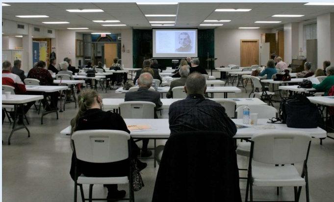
During the Bible-class hour, representatives of the Siberian Lutheran Mission Society made presentations about the Lutheran Seminary in Novosibirsk, Siberia, and the Save the Seminary Campaign.

The mission festival began on Sunday morning with the Divine Service. All eight congregations celebrated the Festival of St. Luke, Evangelist, with guest mission speakers preaching on the Luke 10:1-9 account of Jesus sending the 72 to preach the Kingdom of God and bring the Lord's peace into homes. What an appropriate text for a mission festival supporting the Lutheran Seminary in Novosibirsk, Siberia, Russia, which exists to train and send pastors to replace those who had been persecuted and killed by the Soviet Communists.